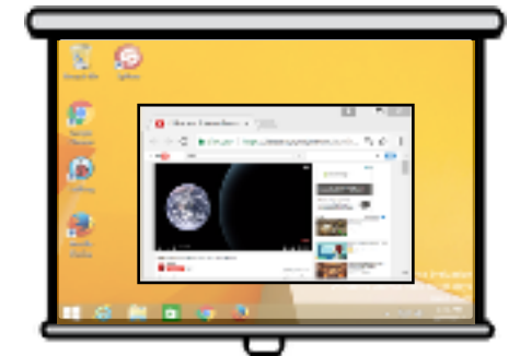
Set-up B: Extended desktop on the right