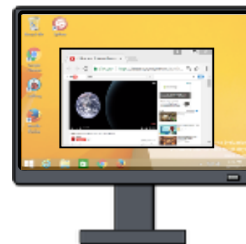
Set-up A: No extended desktop